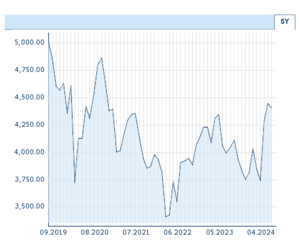
PDF Downloads Company report: UNILEVER PLC

Information about previous performance does not guarantee future performance.