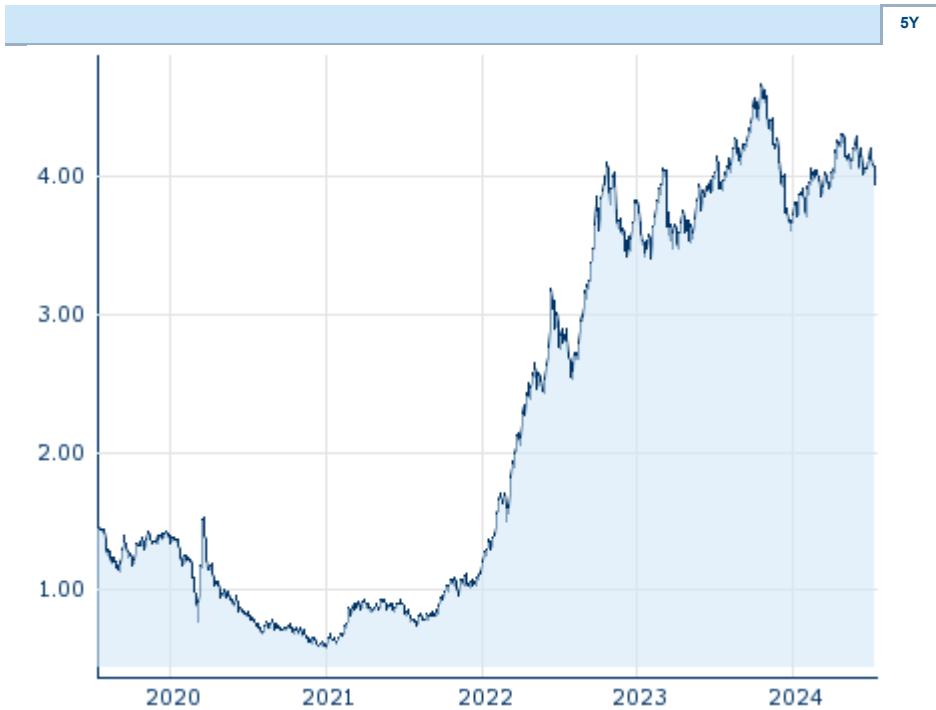
Information about previous performance does not guarantee future performance.