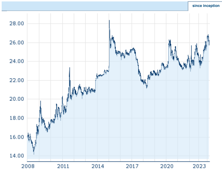
Performance since inception. Performances under 12 month have only little informative value because of the short maturity. Information about previous performance does not guarantee future performance.