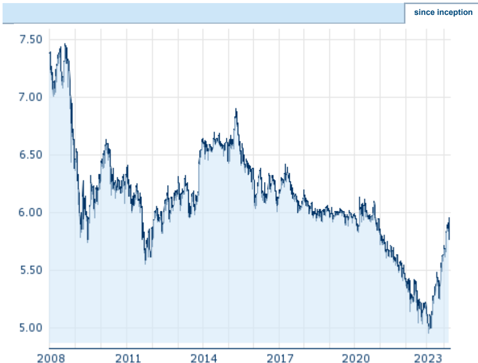
Performance since inception. Performances under 12 month have only little informative value because of the short maturity. Information about previous performance does not guarantee future performance. Source: Česká spořitelna, a. s.