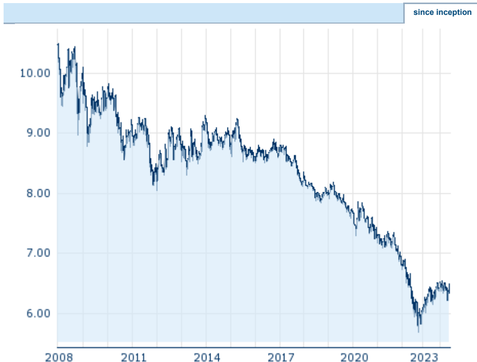
Performance since inception. Performances under 12 month have only little informative value because of the short maturity. Information about previous performance does not guarantee future performance.