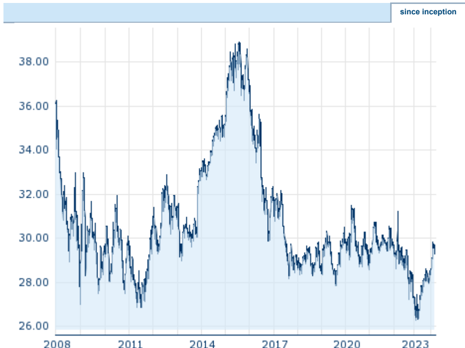
Performance since inception. Performances under 12 month have only little informative value because of the short maturity. Information about previous performance does not guarantee future performance.