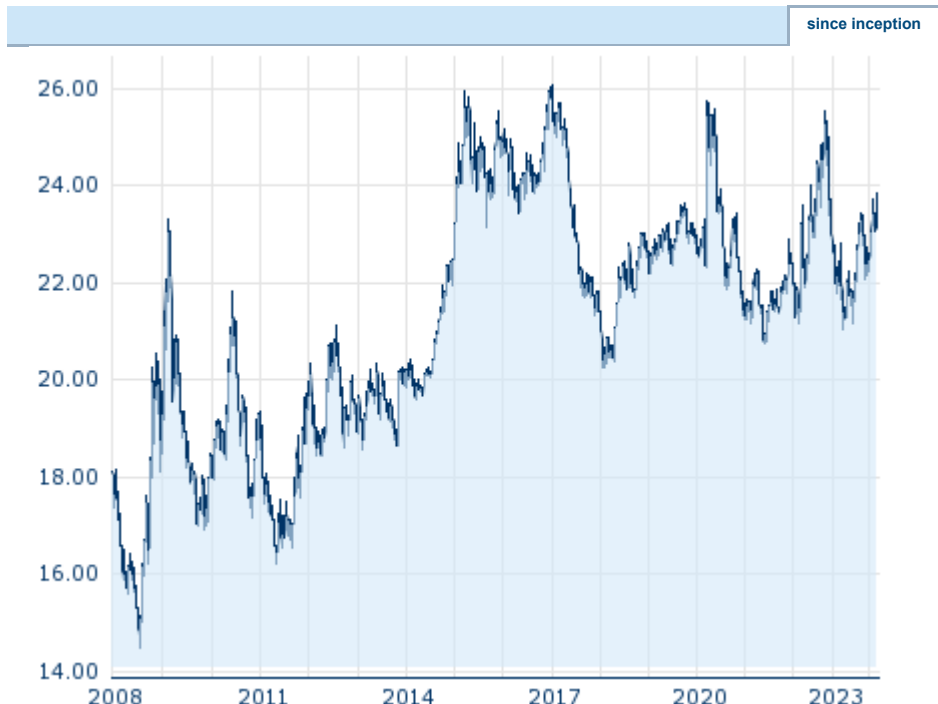
Performance since inception. Performances under 12 month have only little informative value because of the short maturity. Information about previous performance does not guarantee future performance. Source: Česká spořitelna, a. s.