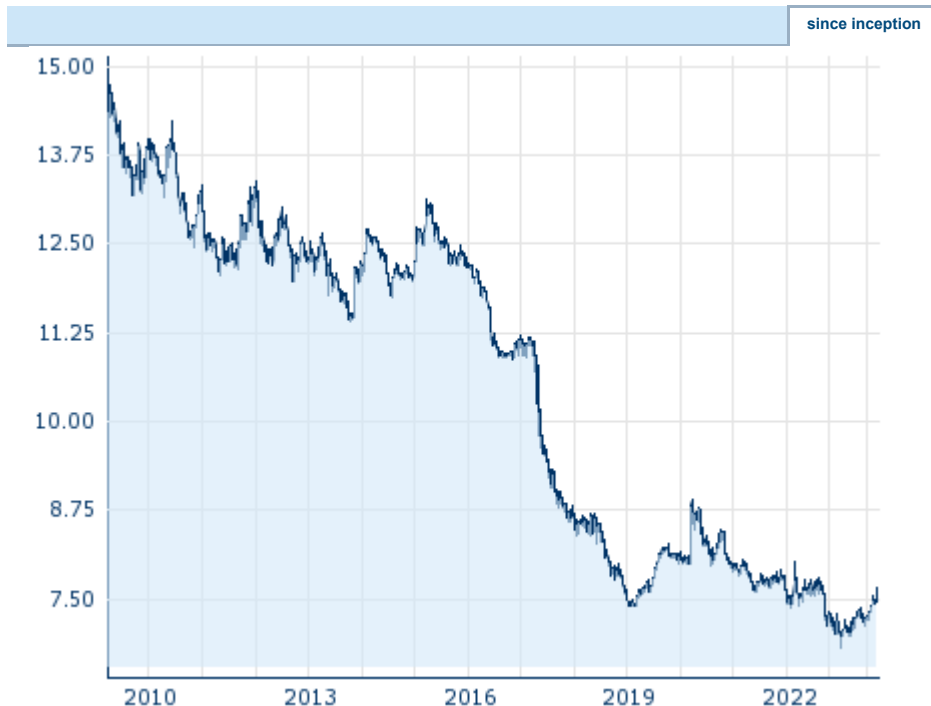
Performance since inception. Performances under 12 month have only little informative value because of the short maturity. Information about previous performance does not guarantee future performance. Source: Česká spořitelna, a. s.