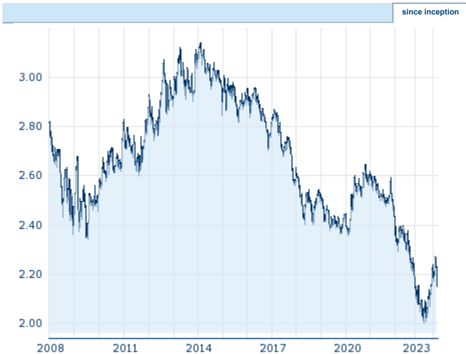
Performance since inception. Performances under 12 month have only little informative value because of the short maturity. Information about previous performance does not guarantee future performance.