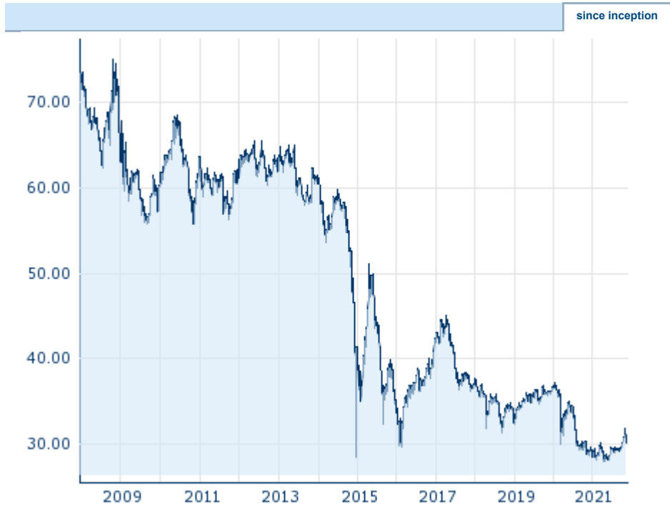
Performance since inception. Performances under 12 month have only little informative value because of the short maturity. Information about previous performance does not guarantee future performance. Source: Česká spořitelna, a. s.