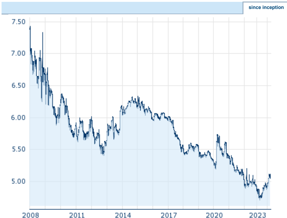
Performance since inception. Performances under 12 month have only little informative value because of the short maturity. Information about previous performance does not guarantee future performance.