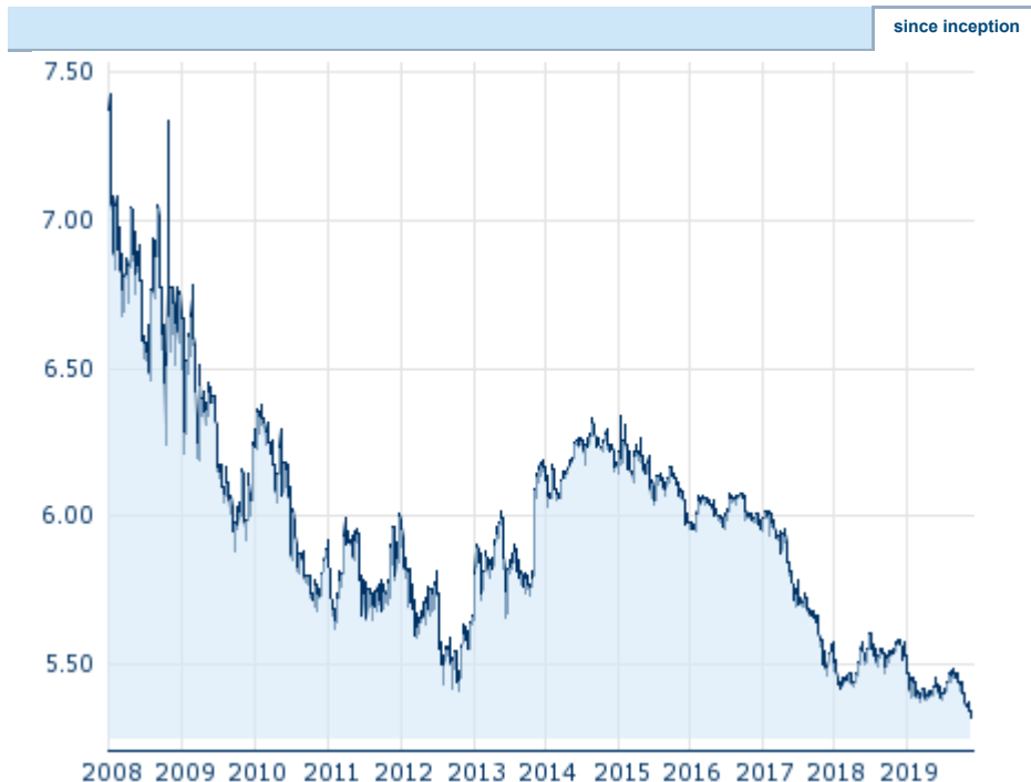
Performance since inception. Performances under 12 month have only little informative value because of the short maturity. Information about previous performance does not guarantee future performance. Source: Česká spořitelna, a. s.