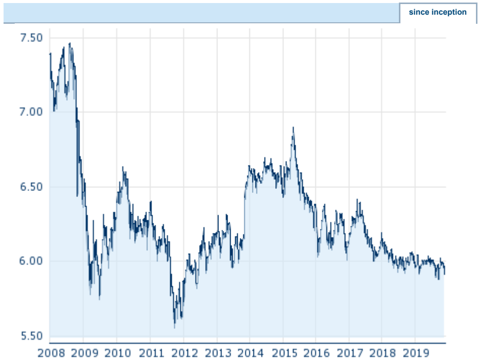
Performance since inception. Performances under 12 month have only little informative value because of the short maturity. Information about previous performance does not guarantee future performance.