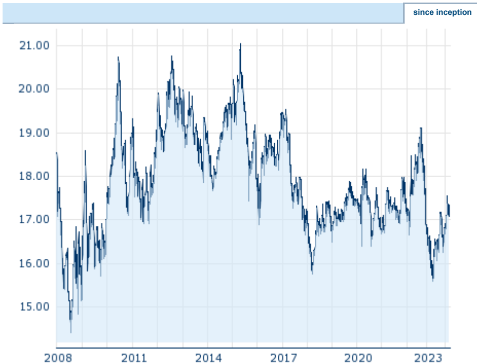
Performance since inception. Performances under 12 month have only little informative value because of the short maturity. Information about previous performance does not guarantee future performance.