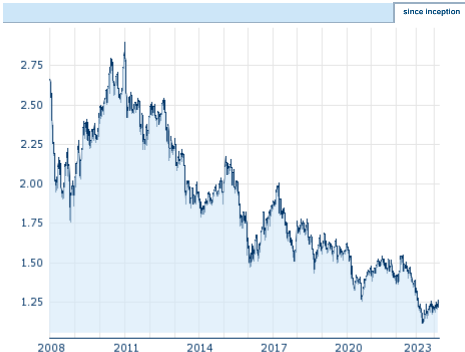
Performance since inception. Performances under 12 month have only little informative value because of the short maturity. Information about previous performance does not guarantee future performance.