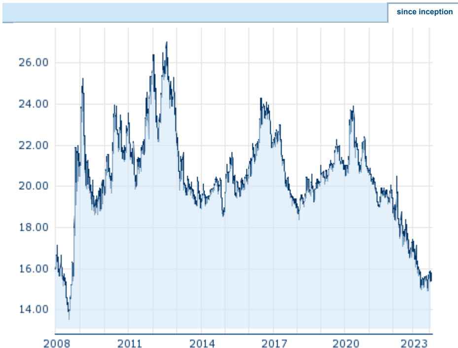
Performance since inception. Performances under 12 month have only little informative value because of the short maturity. Information about previous performance does not guarantee future performance. Source: Česká spořitelna, a. s.