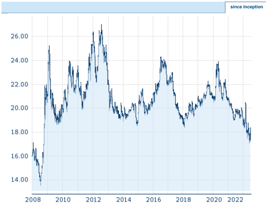
Performance since inception. Performances under 12 month have only little informative value because of the short maturity. Information about previous performance does not guarantee future performance.