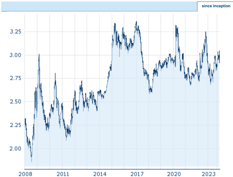
Performance since inception. Performances under 12 month have only little informative value because of the short maturity. Information about previous performance does not guarantee future performance. Source: Česká spořitelna, a. s.