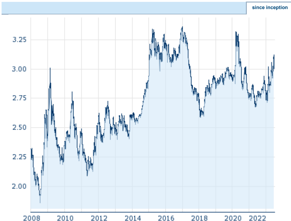
Performance since inception. Performances under 12 month have only little informative value because of the short maturity. Information about previous performance does not guarantee future performance. Source: Česká spořitelna, a. s.