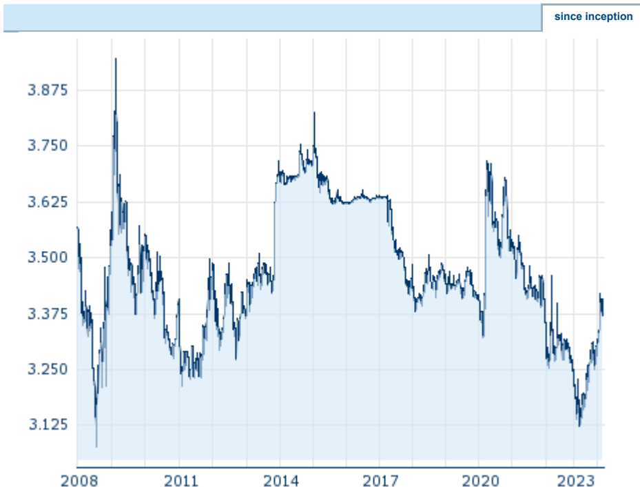
Performance since inception. Performances under 12 month have only little informative value because of the short maturity. Information about previous performance does not guarantee future performance.