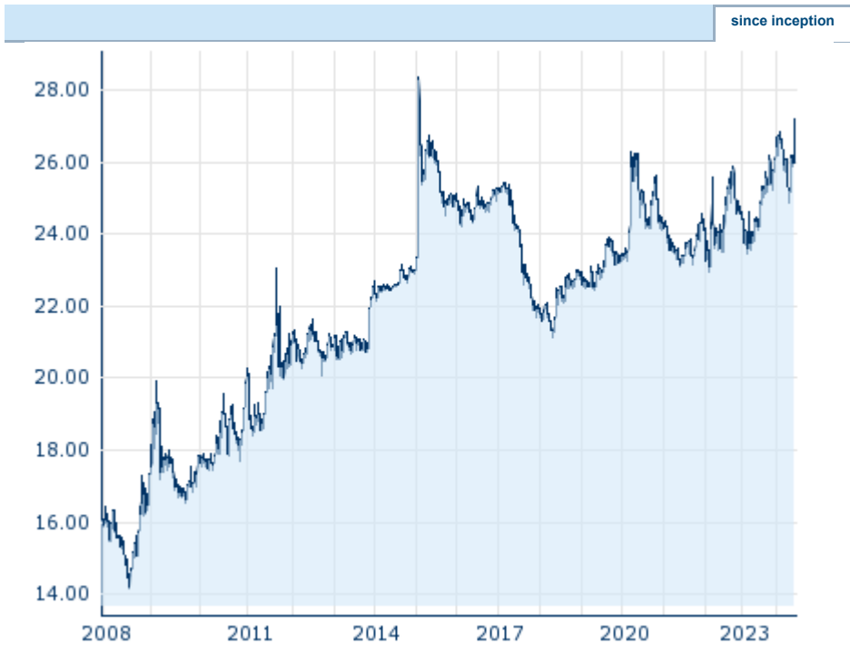
Performance since inception. Performances under 12 month have only little informative value because of the short maturity. Information about previous performance does not guarantee future performance.