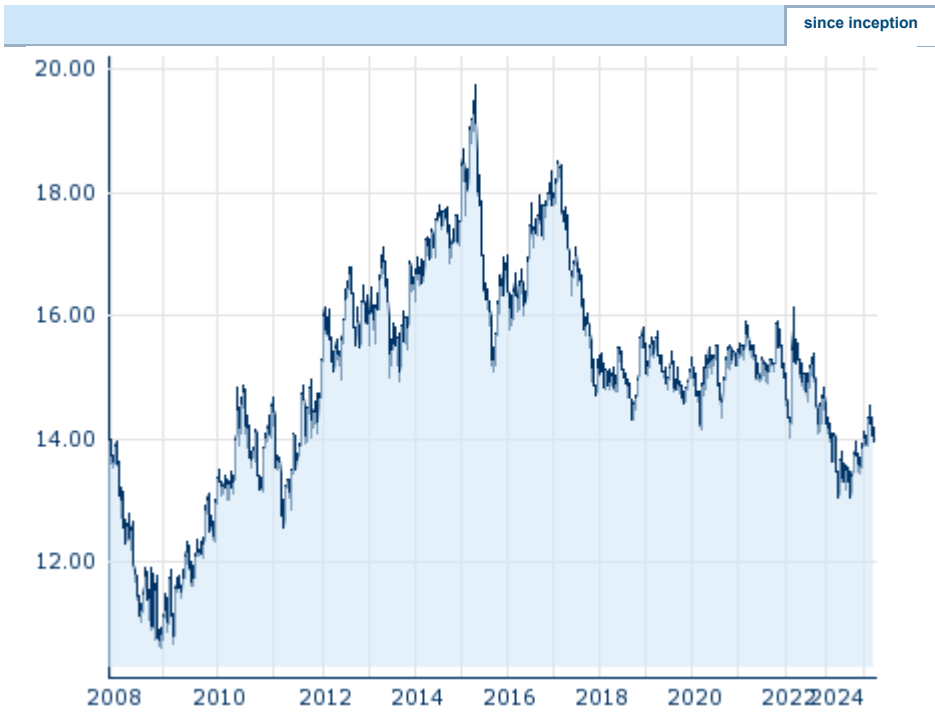
Performance since inception. Performances under 12 month have only little informative value because of the short maturity. Information about previous performance does not guarantee future performance.