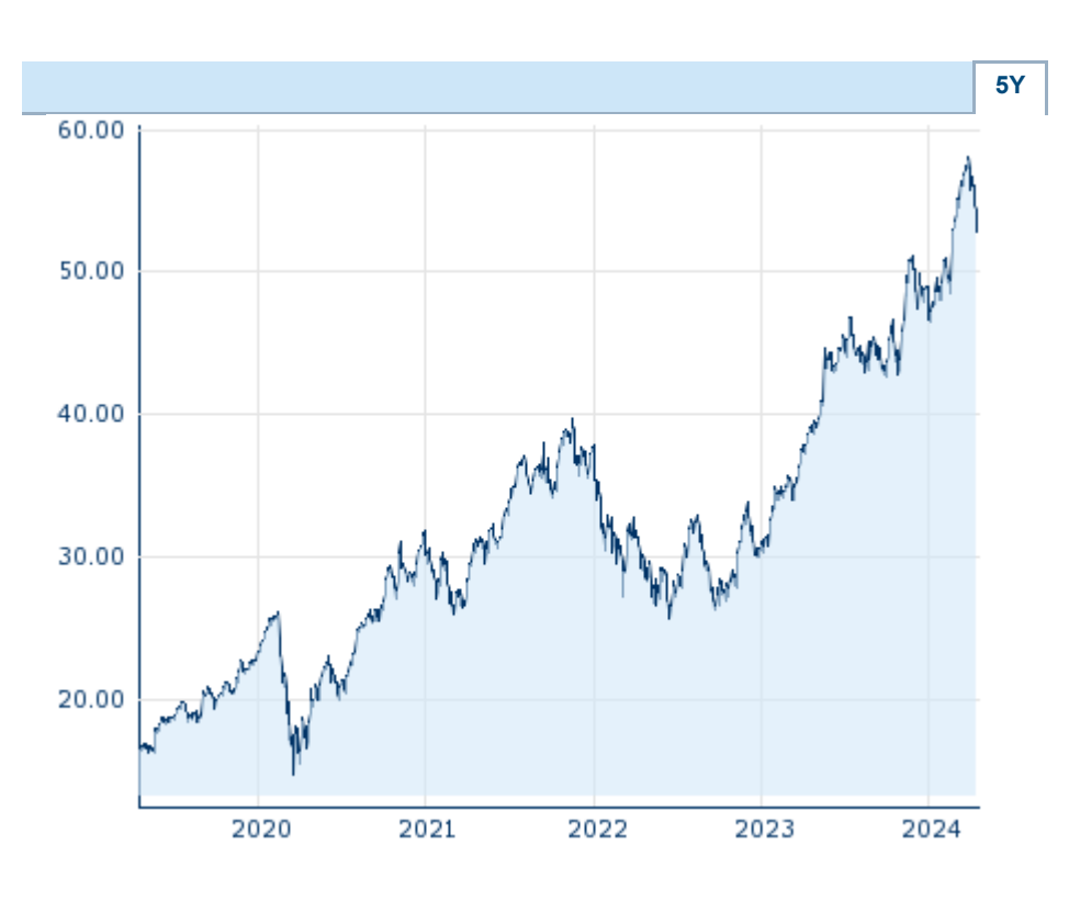
PDF Downloads Company report: COPART INC.

Information about previous performance does not guarantee future performance. Source: FactSet