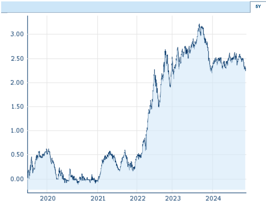
Information about previous performance does not guarantee future performance.