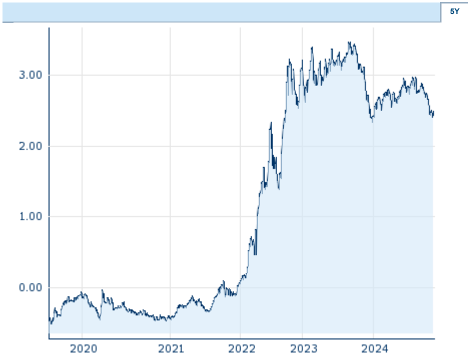
Information about previous performance does not guarantee future performance. Source: FactSet